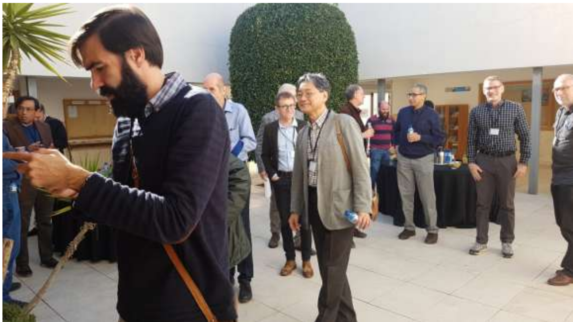
Conference Hall, University of Alicante