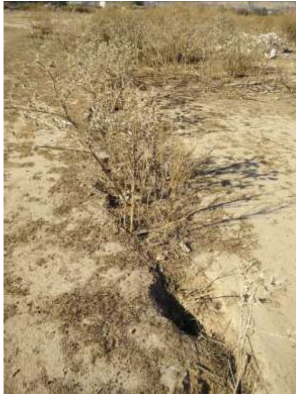
Earth Fissure in Murcia, Guadalentin Valley, Spain