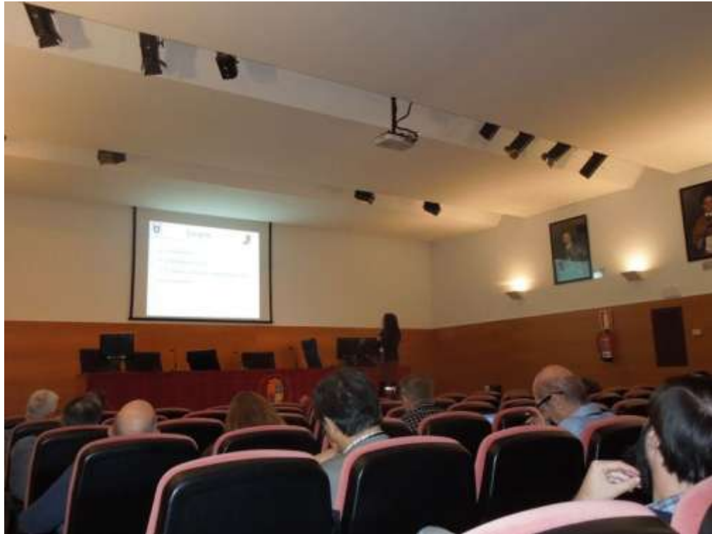
Conference Hall, University of Alicante