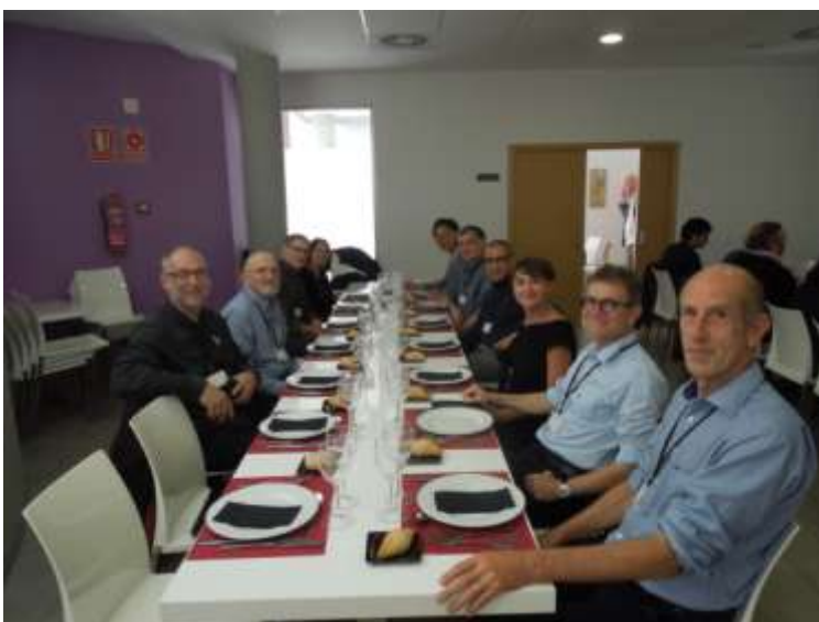
Workshop at the University of Alicante