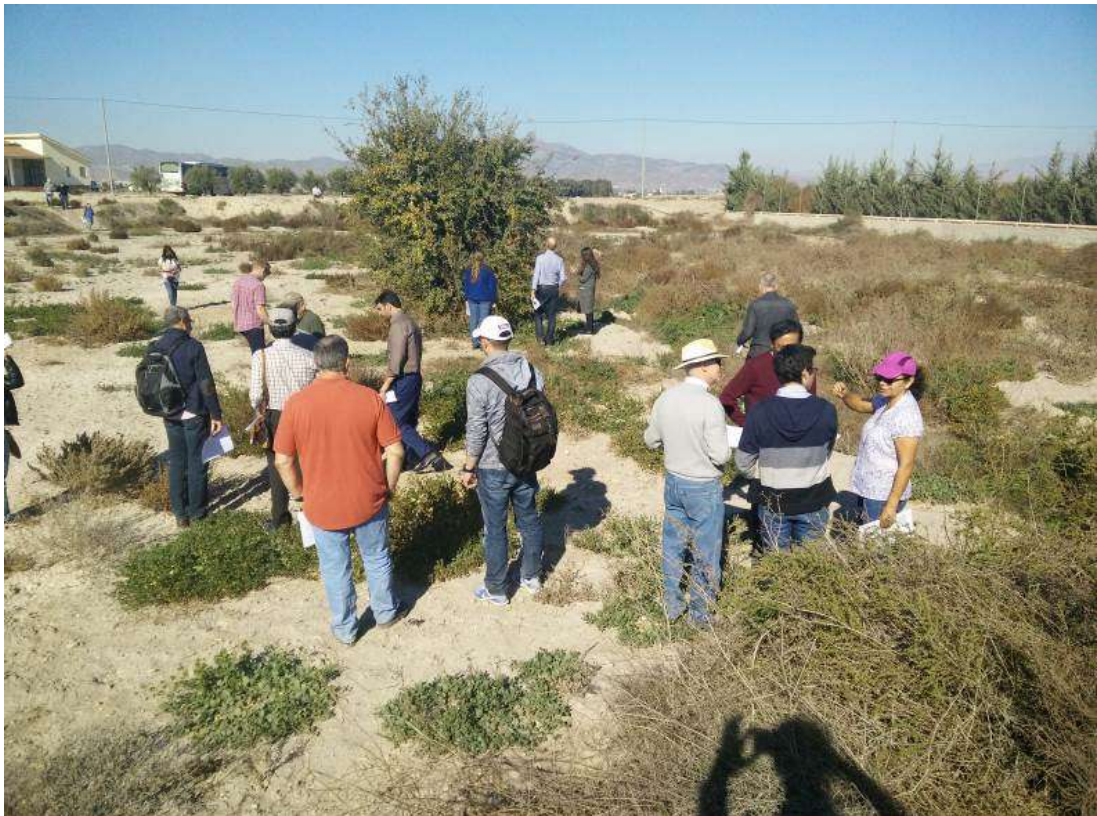
Field trip stop in Murcia, Guadalentin Valley, Spain