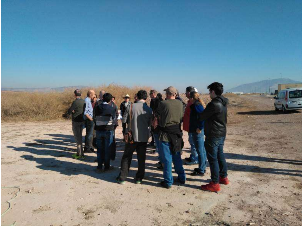
Field trip stop in Murcia, Guadalentin Valley, Spain